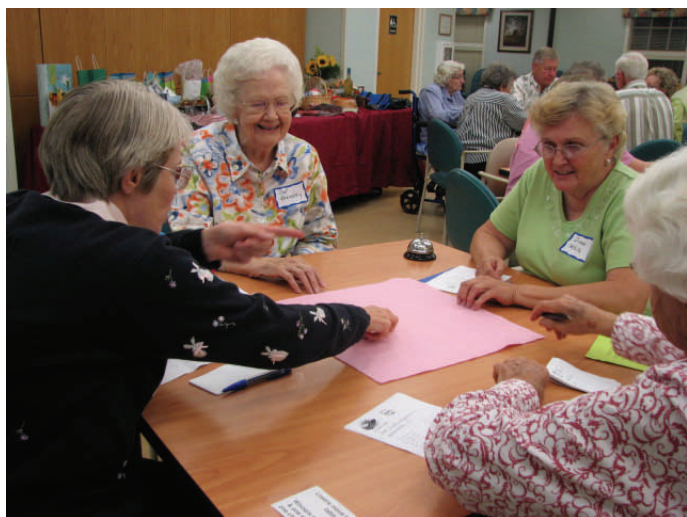
Thanks to everyone who attended our BUNCO party. Everyone had a wonderful time and it was a big success!