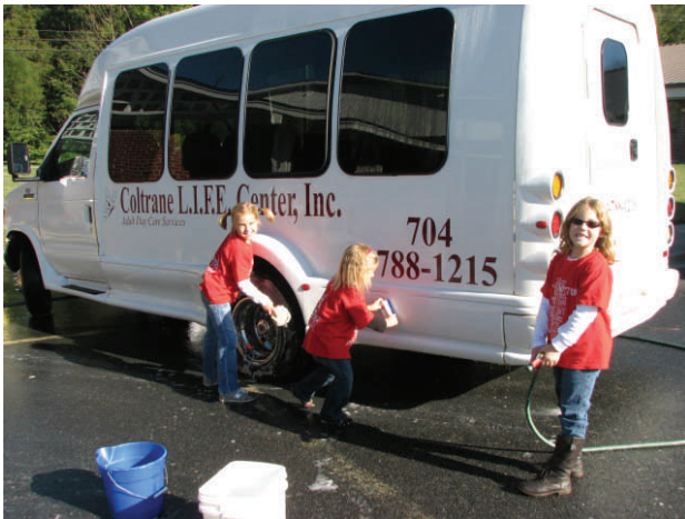
Thank you to Central United Methodist Church for spending a Saturday morning volunteering at the LIFE Center.