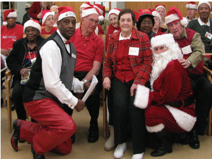
After a tone chimes performance for their families and other visitors, participants had fun with Santa.